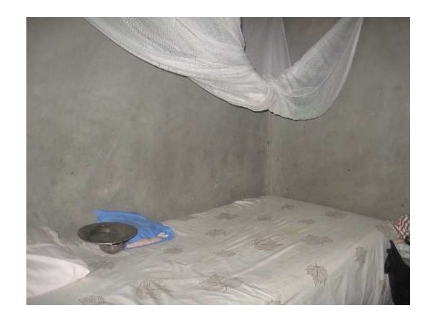
Figure 14 Bed with netting