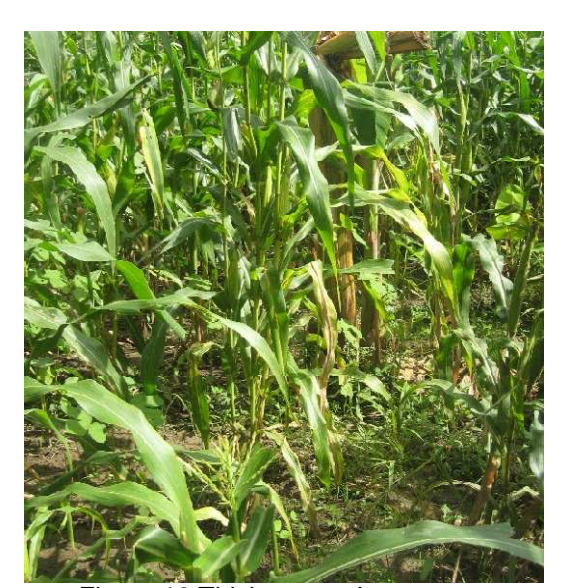
Figure 10 Thick vegetation

Although all mothers had access to the hospital in terms of physical proximity, multiple barriers to accessing skilled care at the hospital were identified. The expense of hospital based care and difficulty traveling, particularly during labor were described as barriers to giving birth in the hospital. Some mothers had to travel through thick vegetation and pass a river to get to the hospital. One of the gatekeepers, cut through the vegetation with a machete and guided me through banana trees to reach the mothers in his village. See Figures 10 and 11 for photographs of the thick vegetation and banana trees. During and after rainfall, the streets and paths used for transportation by foot or other means became muddy and sometimes flooded, making travel very difficult. The difficulty of travelling in such conditions was experienced during data collection. See Figure 12 for photograph of a muddy trail.