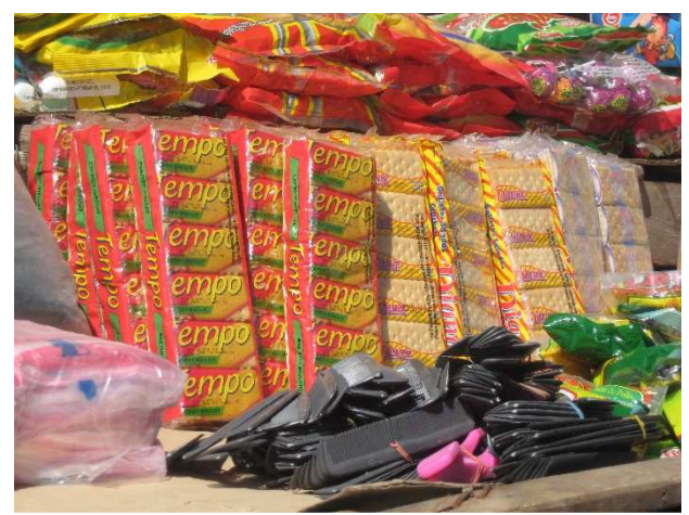
Figure 8 Market commercially prepared items