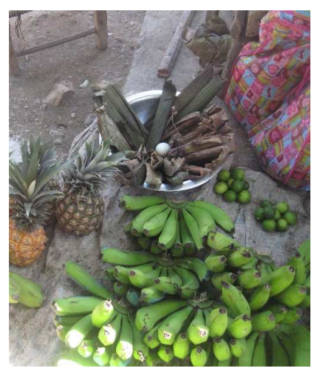
Figure 9 Market produce