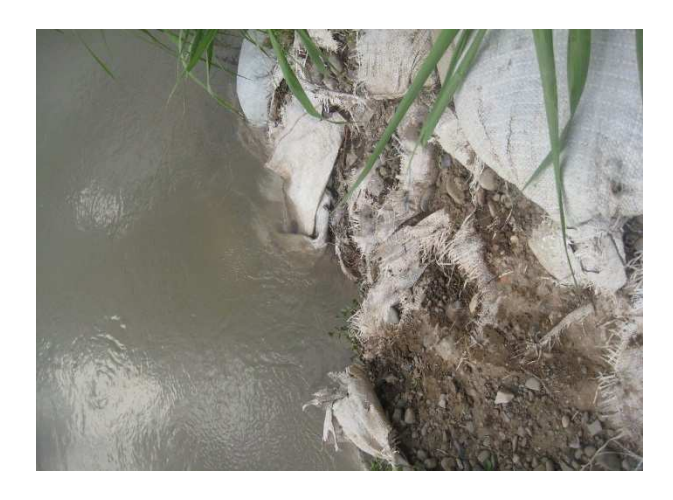
Figure 6 River water

A vibrant local market was particularly active on Wednesdays within the town. A variety of local produce, meats, commercially prepared foods, hygiene items, clothes and shoes were available at the market. See Figures 7, 8, and 9 for photographs of the market.