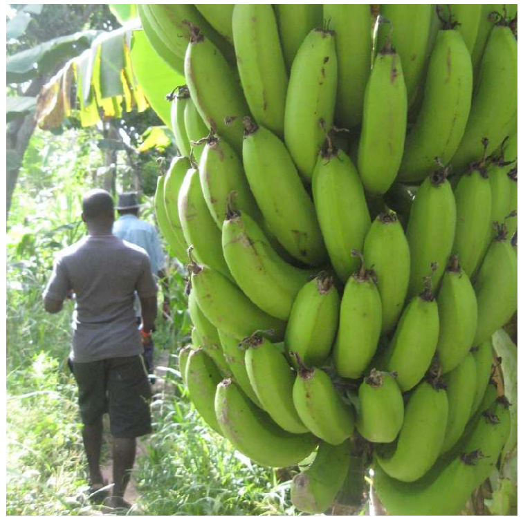
Figure 11 Banana trees