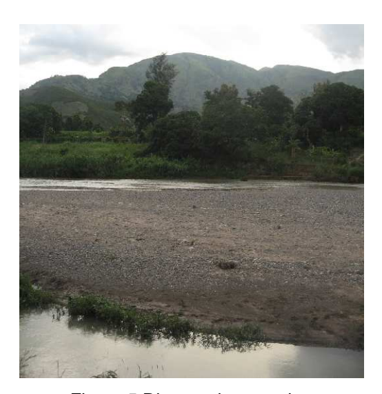
Figure 5 River and mountains

and institutions discussed by the mothers. The town's topography was mountainous with rivers present as depicted in the photograph presented in Figure 5.