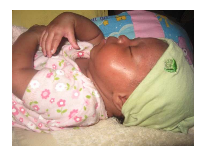
Figure 15 Infant clothed