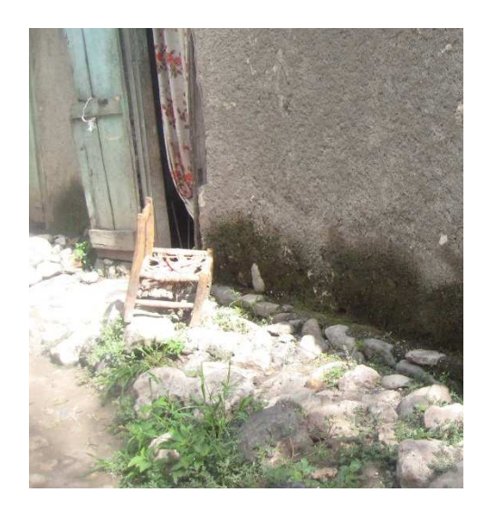
Figure 3 Chair

During every interview, I sat often as mothers and others present squatted or stood. A social custom of offering a chair or place to sit to visitors was extended to me as a sign of welcome. Often I was given the only chair for the household. See Figure 3 for a photograph of a typical chair. When no chair was available another provision was provided to me. Several times I sat on the mother's bed alongside her. In the case of Mothers 19 and 20, I was given a plastic bucket placed with the open end on the dirt ground with the closed end draped with a piece of cloth taken freshly off the clothesline to create a seat.