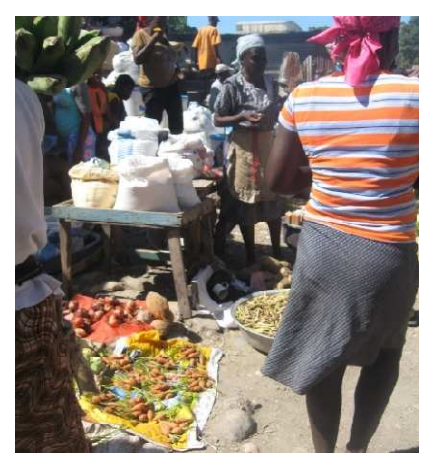
Figure 7 Market

A vibrant local market was particularly active on Wednesdays within the town. A variety of local produce, meats, commercially prepared foods, hygiene items, clothes and shoes were available at the market. See Figures 7, 8, and 9 for photographs of the market.