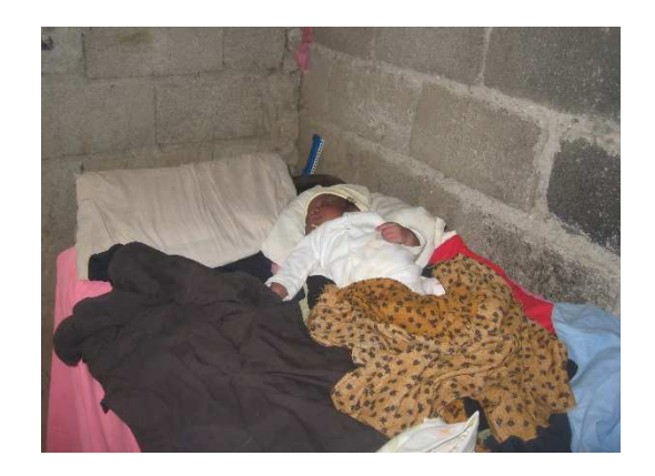
Figure 13 Bed without netting