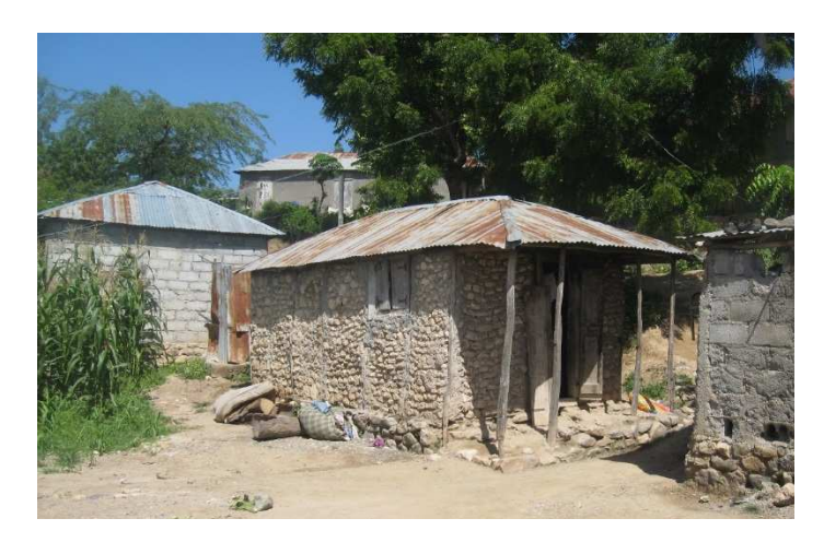
Figure 4 Home

Homes were dark with an open door the only source of light during interviews. The air was hot and stagnant due to the tropical climate and lack of air flow in the enclosed quarters. The buzzing sound of mosquitos warned of the inevitable bites that would follow. See Figure 4 for a photograph of a typical home.