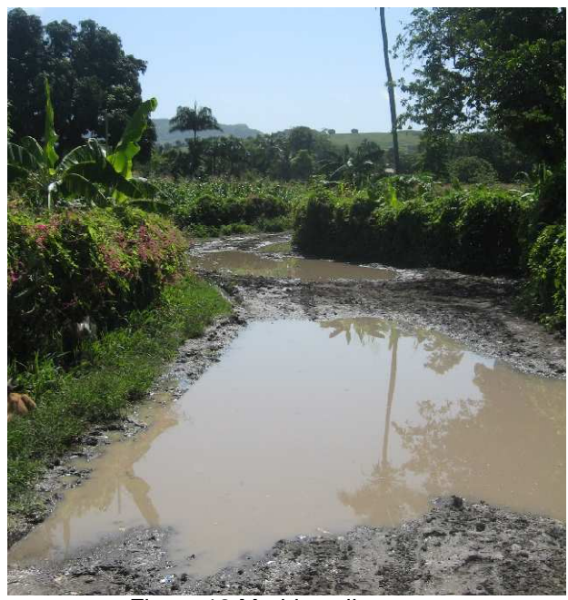
Figure 12 Muddy trail

Beliefs regarding the normalcy of pregnancy and birth as well as the view that the hospital was a place to go when sick prevented some from accessing skilled care at the hospital. For example, Mother 13 stated she gave birth at the hospital "paske malad" meaning because she was sick. Mothers 19 and 21 stated they would have gone to the hospital if there had been a problem. In contrast, Mother 24 who gave birth to her previous child at home without incident gave birth at the hospital for her most recent birth because the hospital provided her with "plis sekirite" (greater security).