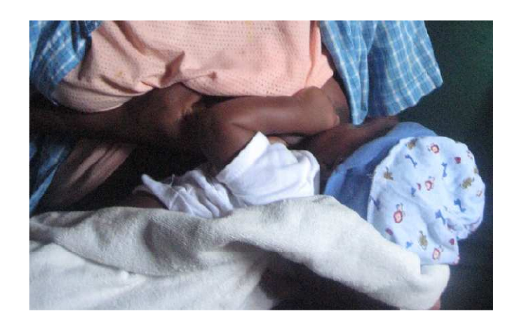
Figure 17 Infant breastfeeding

A total of 24 (96%) participants reported that their child had no problems breastfeeding the first time they attempted to initiate breastfeeding. See Figure 17 for photograph of infant breastfeeding. Mothers described how the baby was able to "pran fasil" easily take the breast which would most likely be described as infant latching well or easily in English. The child of Mother 19 that did not initiate breastfeeding with first breastfeeding attempt had respiratory issues after birth which will be discussed in detail related to events.