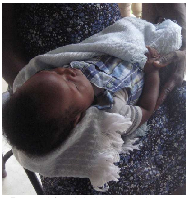
Figure 16 Infant clothed and wrapped